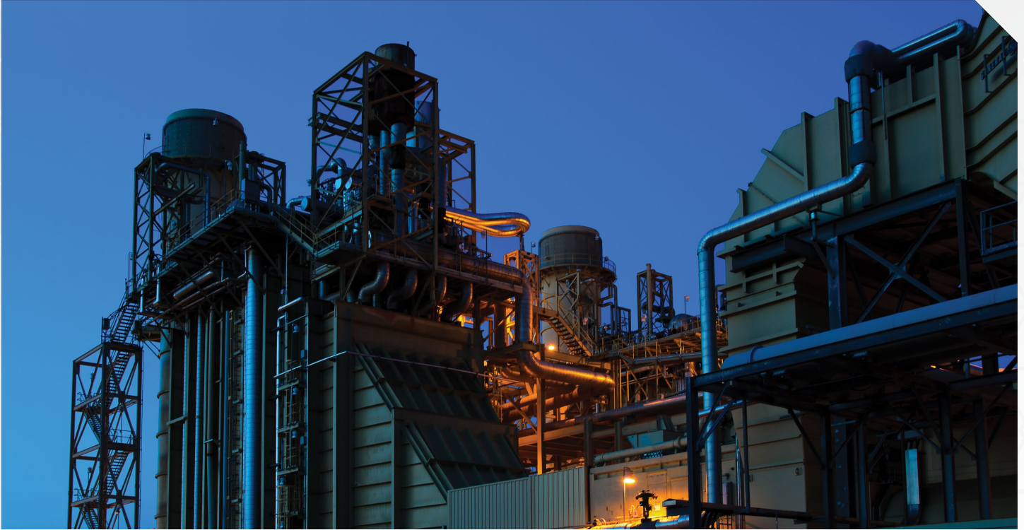
Holland Energy helps meet energy needs when demand increases.

THE HOLLAND ENERGY COMBINED CYCLE PLANT PROVIDES AN IMPORTANT ROLE IN HOOSIER ENERGY'S DIVERSE, "ALL-OF-THE-ABOVE" POWER SUPPLY STRATEGY.